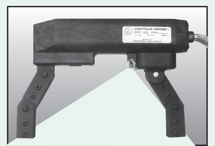
B300 - A.C. Contour Probe. Available with Y300 Yoke Light. Also available with GFI Plug.