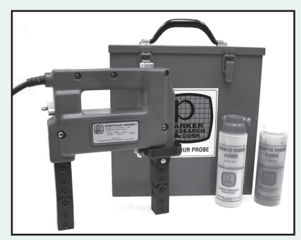
DA-400 Shown With "A" Kit items. Kit items are available with dry powder and Wet Fluorescent inspection mediums. Including Black Light and Steel Carrying Case.