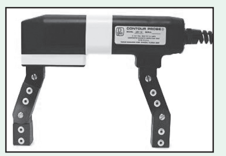
UW115 & UW12 Underwater A.C. and D.C. Yokes.