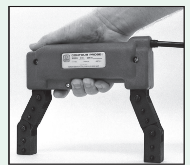
B100 - Our most economical A.C. Contour Probe. Available in 115VAC and 230VAC. May be ordered with the Y400 Yoke Light at extra cost.