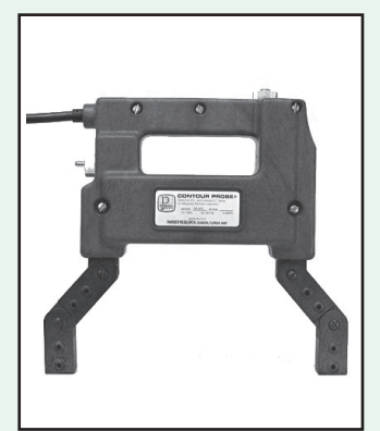
DA400 - Contour Probe. Most popular A.C./D.C. Yoke. Available in various Kit forms. Y400 Yoke Light additional.