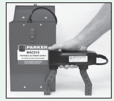
BAC310 - Portable, Stand alone Battery Inverted 115VAC Power Supply. Operate A.C. Yokes or other Instruments where normal power sources are unavailable.