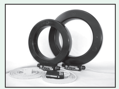
PL8 & PL10 - Magnetizing Coils. 8" & 10" I.D. Complete with Carrying Case.