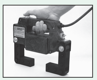
A210 - Heavy Duty A.C. Contour Probe. Strongest A.C. Field Yoke available. Model DA200 available for A.C./D.C. Operation.