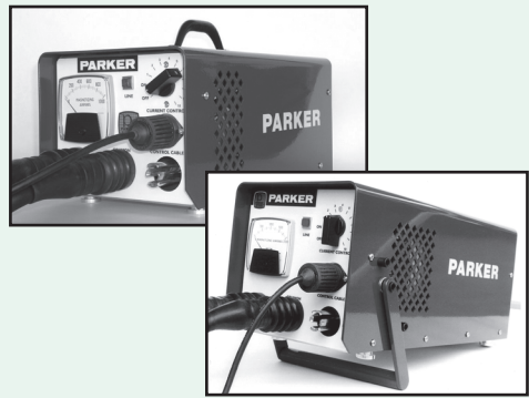
DA750 & DA1500 - Portable Mag units. Heavy duty 750 or 1500 AMP. Available with all accessories.