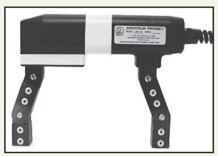
UW115 & UW12 Underwater A.C. and D.C. Yokes.