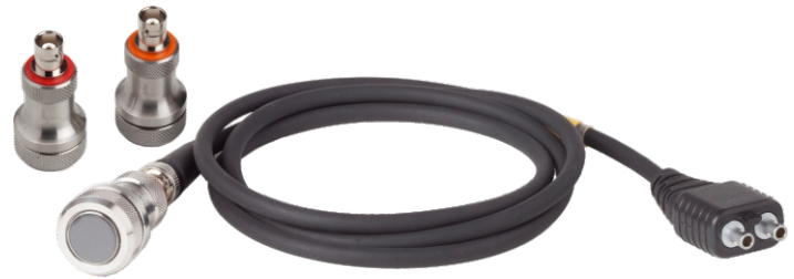
S2C, S3C & S5C Probes

The INOX probes have an updated ergonomic design and easier to read frequency, identification and serial number. All frequencies of INOX probes have a black face and a colour coding system to identify probe frequencies. Used in Multiple-Echo mode, these probes require no zeroing, have a high linear accuracy, are ideal for general thickness gauging, for use on pipes and have replaceable wear membrane for long life.