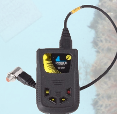
Cygnus 2+ Hands-free