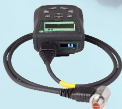
Cygnus 6+ Pro