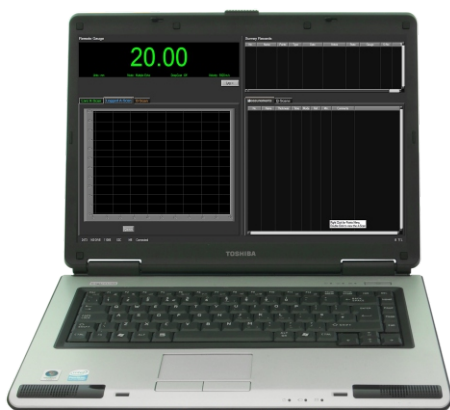
Upgrade Kit A

Unbiblical cable length is specified by the customer up to a maximum of 1000 metres (3,280ft)