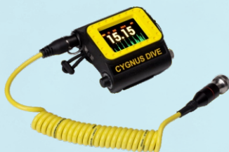
DIVE (Underwater A-Scan)