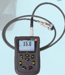
Cygnus 4 General Purpose