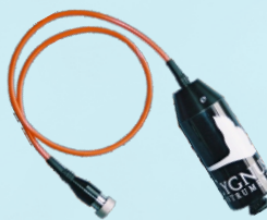
Mini ROV Mountable