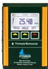
Upgrade Kit B