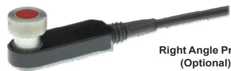
Right Angle Probe (Optional)

With multiple echo, readings are taken by measuring the time delay between any three consecutive backwall echos. The time of T1 (coating thickness) is ignored. The times of T2 and T3 are equal to the time that it takes to travel through the metal. Only by looking at three echos can the measurements be automatically verified (where T2 = T3).